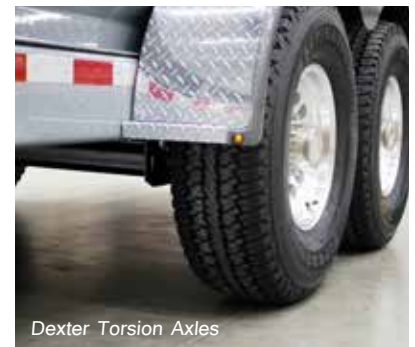
Dexter Torsion Axles