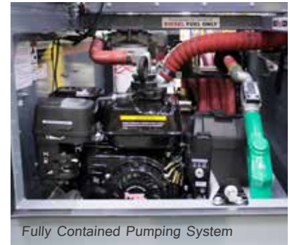
Fully Contained Pumping System