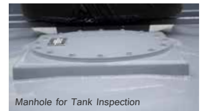
Manhole for Tank Inspection